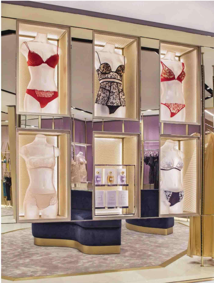
LEFT, BELOW Metallic accents throughout the space visually link the other materials used, helping to create a cohesive statement.

space by a white marble floor adorned with two sapphire blue moquette carpets featuring a diagonal fishtail pattern. Its French twist carpets flank a contemporary metal-clad grand staircase, a strong architectural statement further accentuated by strips of light dividing the staircase's metal panel coverings, making it glow. Positioned on the thick pile carpets are sets of linear glass showcases with brass legs and trim.