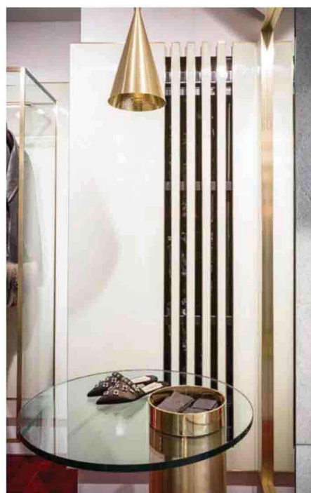
RIGHT The store’s designers selected glass and brass elements throughout to convey an understated elegance.

among the Alpine resort village’s quaint shops and tourist offerings.