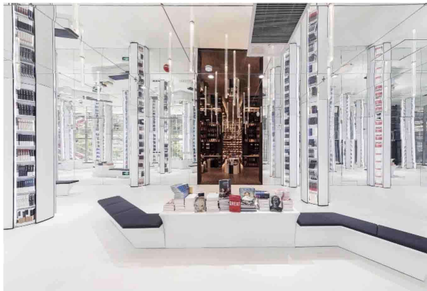
Zhongshuge's "forest" area features mirror-clad columns and a mirrored ceiling, making the bookshelves appear endless and encouraging customers to browse.

height upward, since the store is situated in a shopping mall. Columns throughout the space also created a hurdle. Most of these issues were mitigated by the striking mirrored ceiling the designers installed throughout, which visually expands and enhances the spaces. Most of the columns were also clad in reflective surfaces, making them appear less intrusive.