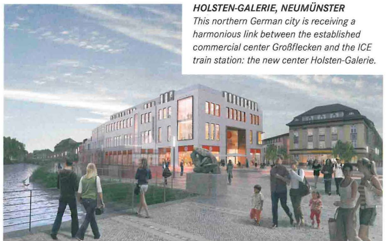
HOLSTEN-GALERIE, NEUMÜNSTER This northern German city is receiving a harmonious link between the established commercial center Großflecken and the ICE train station: the new center Holsten-Galerie.