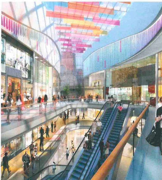
AQUIS PLAZA, AACHEN Unique interior design: The shop facades on the shopping street partially extend over two floors and give the Aquis Plaza a unique feeling of space.

The shopping centers that ECE is currently building impress onlookers with their optimal architectural designs. A selection.